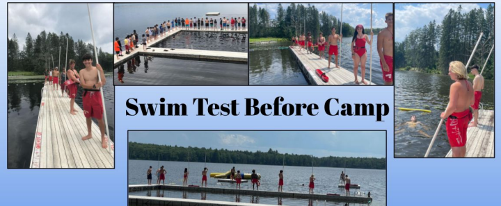
Swim Test Before Camp

If taking a certain badge is very important to your Scout, be sure they sign up early! We will not be able to add Scouts beyond the capacity limits.